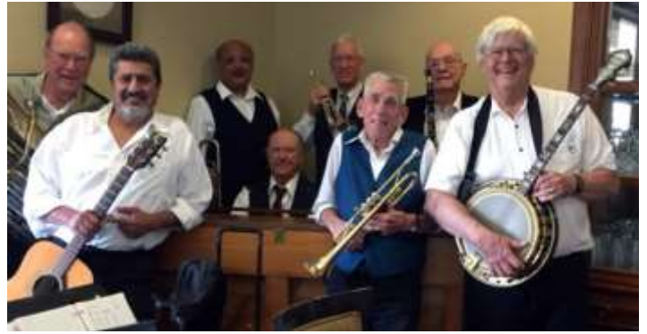
The Russian River Ramblers

We follow all state and county COVID-19 Health & Safety protocols.